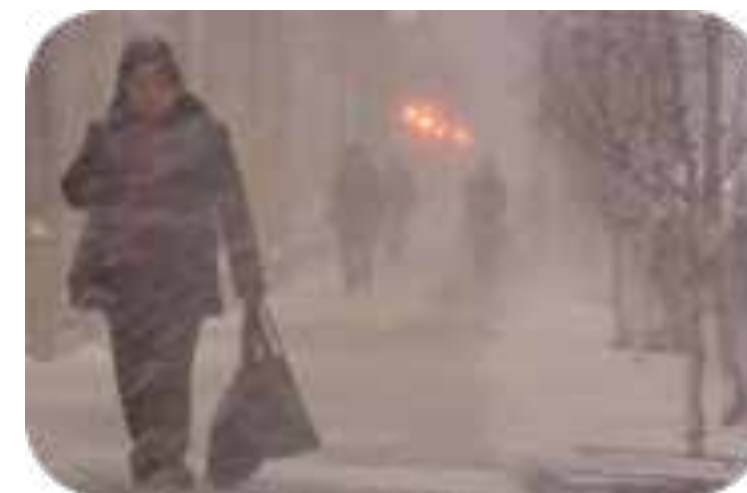
Changes to rain and snow