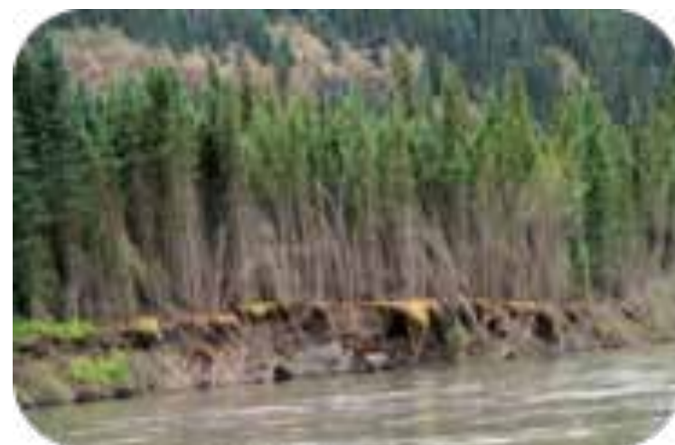
Erosion and Slope Stability