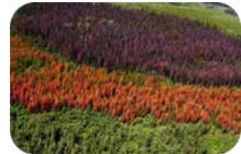
Changes to vegetation and animals