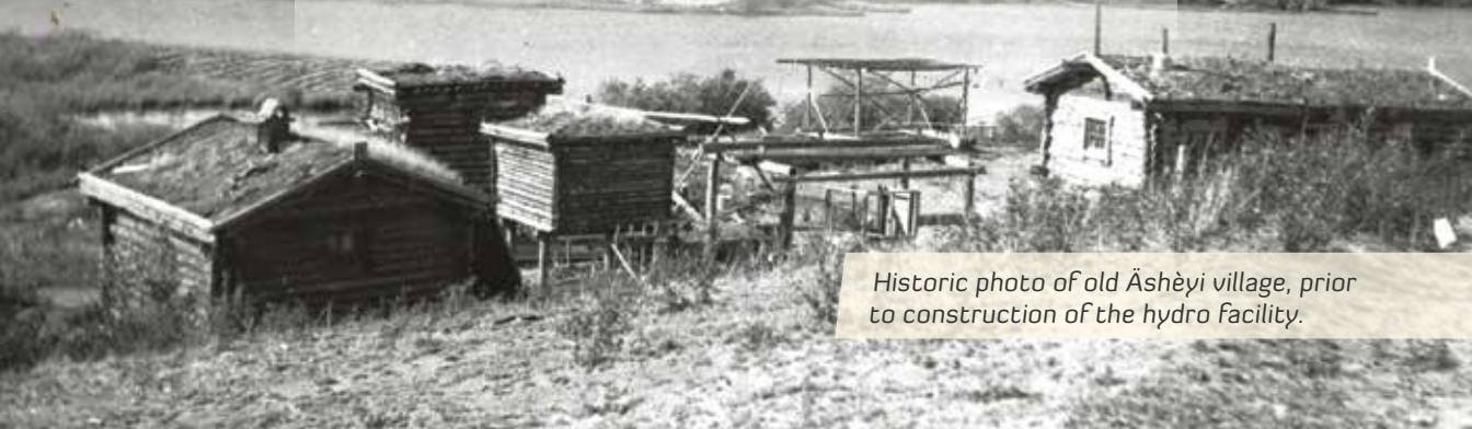
Historic photo of old Äshèyi village, prior to construction of the hydro facility.