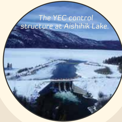
The YEC control structure at Aishihik Lake.