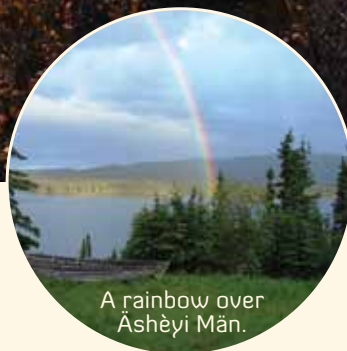
A rainbow over Ashèyi Män.