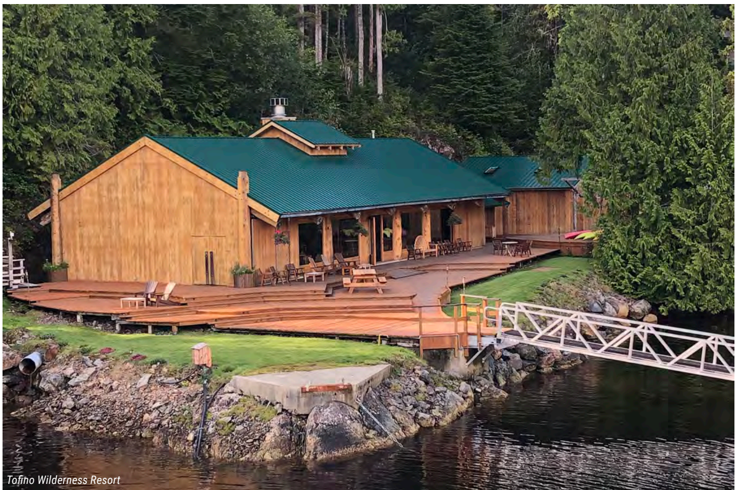
Tofino Wilderness Resort