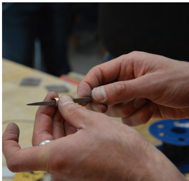
(Left): A popular copper bead making workshop was hosted by Brenda Lee Asp.