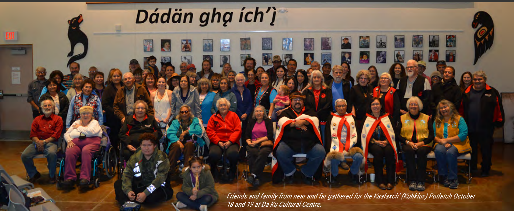
Friends and family from near and far gathered for the Kaalaxch' (Kohklux) Potlatch October 18 and 19 at Da Kų Cultural Centre.