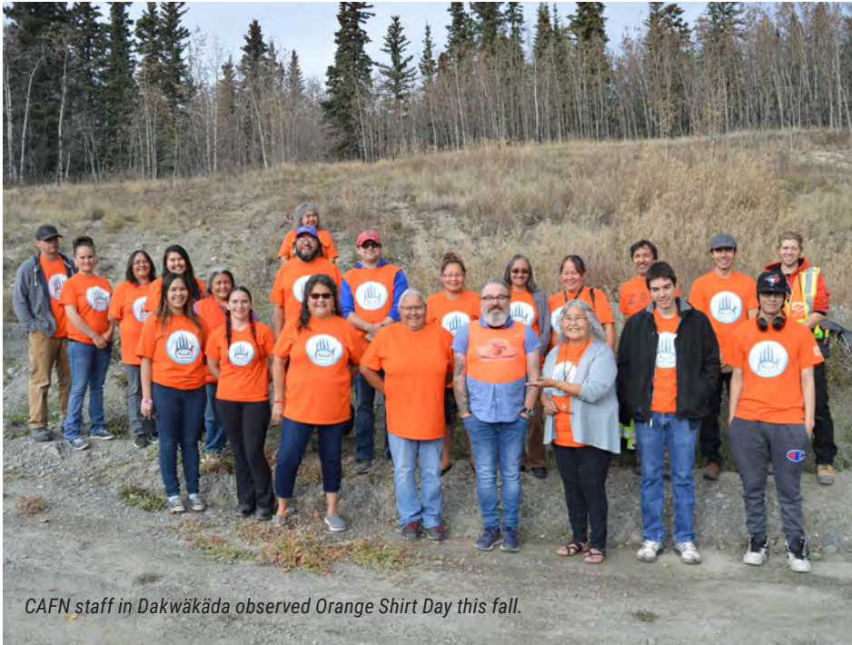
CAFN staff in Dakwākāda observed Orange Shirt Day this fall.