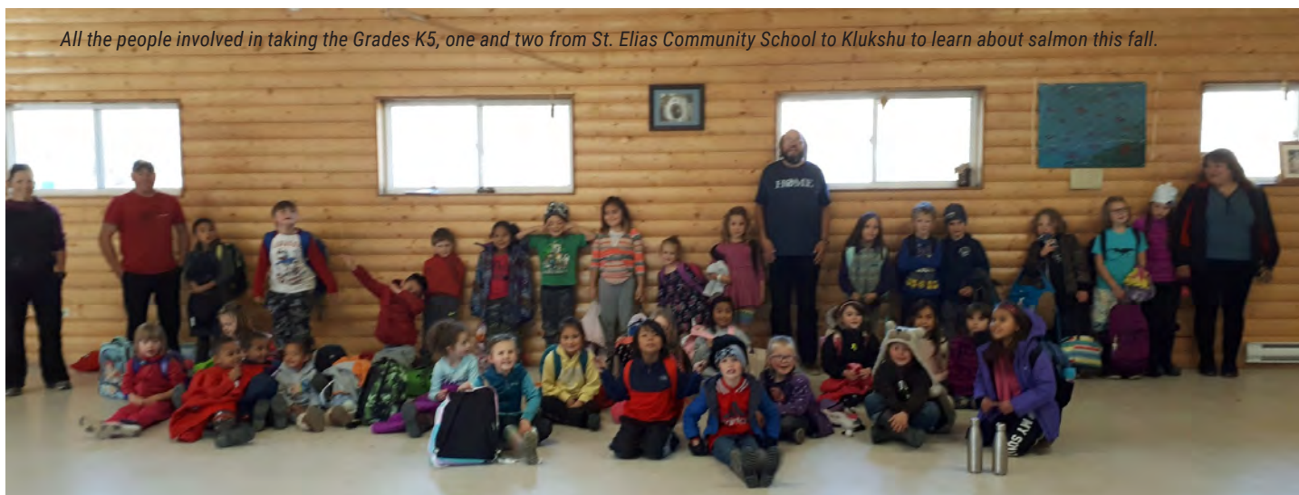
All the people involved in taking the Grades K5, one and two from St. Elias Community School to Klukshu to learn about salmon this fall.