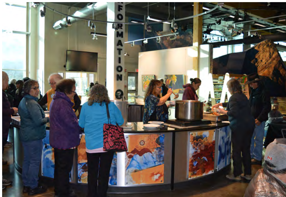
(Above): Participants enjoyed meals served in the Yukon and Parks Canada visitor information wing at Da Kų.

For more details, please visit https://cafn.ca/event/kohklux-map-anniversary-gathering .