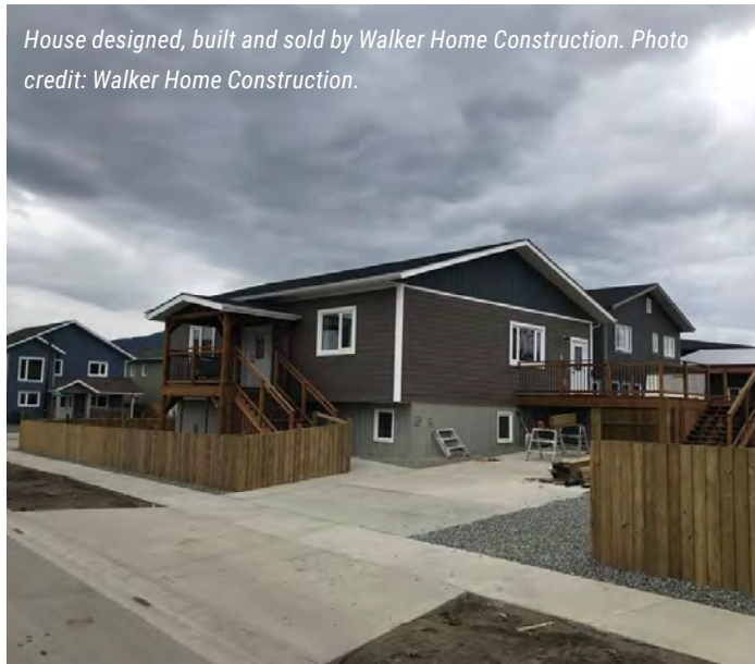
House designed, built and sold by Walker Home Construction.

“We’re warriors and it means something to be a Champagne and Aishihik citizen.”