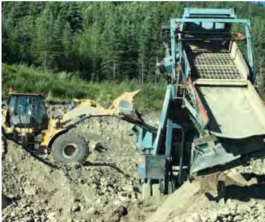
Castle Rock screening operation at the quarry.

Panache Ventures launched in March 2018 and are raising capital for a private equity capital fund of $58 million, intending to invest in a portfolio of approximately 100 companies across Canada. The sector focus areas are artificial intelligence, fintech, digital healthcare, enterprise software and block chain.