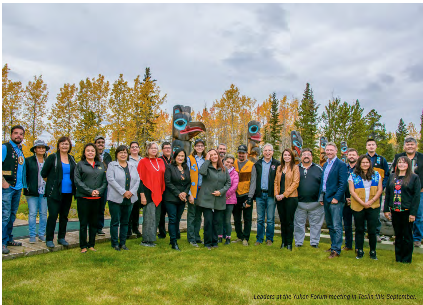
Leaders at the Yukon Forum meeting in Teslin this September.