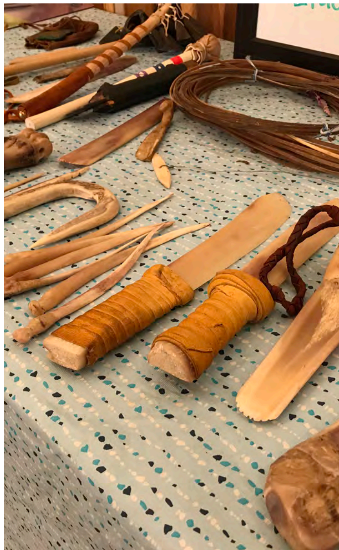
All photos: Students in the Dän Dákeyi Uyenji interpretive guiding course learn to make bone tools and snowshoes.