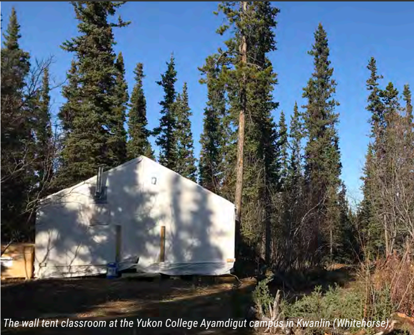
The wall tent classroom at the Yukon College Ayamdigut campus in Kwanlin (Whitehorse).