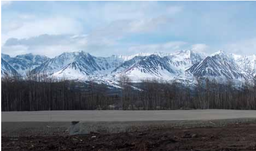
The CAFN Cultural Centre site with the building pad in the foreground. The Centre will offer a spectacular view of the St. Elias Mountains.

A Site Blessing Ceremony is being held May 5, 2010 to to bless the building site and to ensure construction goes ahead in a safe and respectful manner. The ceremony is being led by Wolf and Crow elders.