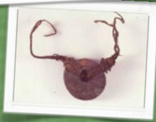
Lower Left: he wore this small bead made of native copper mounted on sinew.