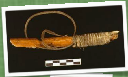
Upper Left - the knife he carried.

A CHAMPAGNE AND AISHIHIK FIRST NATIONS SPECIAL REPORT