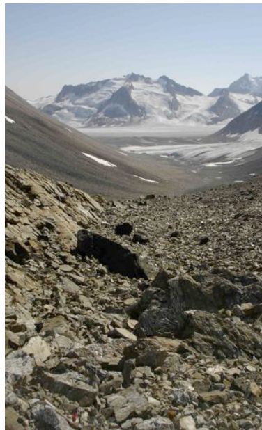
Looking southeast from the discovery site area. The Long Ago Person came from this direction, and would have crossed the glacier in the distance. The Haines Road is located east of the mountain on the left.

The autopsy showed he was a healthy young man in good physical shape at the time of his passing. No obvious cause of death was determined; he may have died from exposure.