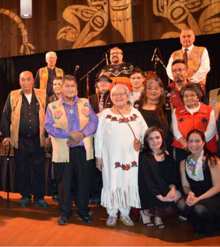
A few of the representatives and past Councils for the four governments.