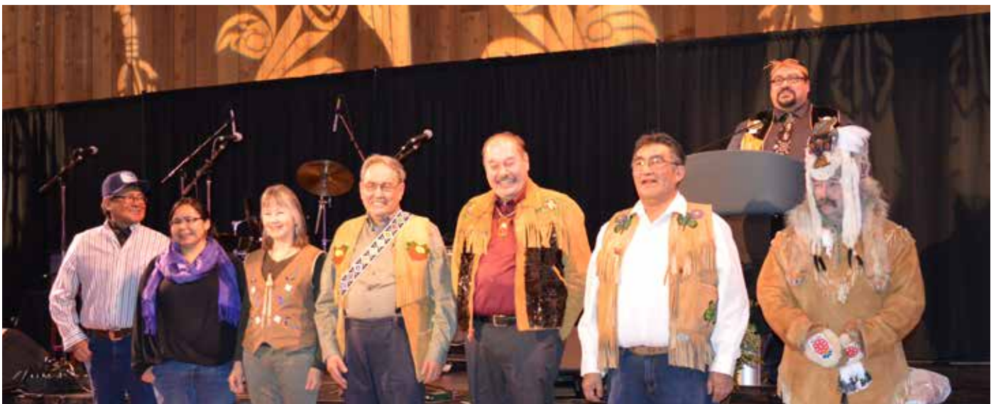
CAFN honoured its 1994-1998 Chief and Councillors, who began implementing the CAFN Final and Self-Government Agreements when they took effect in 1995.

Champagne and Aishihik First Nations (CAFN), the First Nation of Na-cho Nyäk Dun (NND), Teslin Tlingit Council (TTC) and Vuntut Gwitchin First Nation (VGFN), hosted a 20th Anniversary Celebration this March at the Kwanlin Dün Cultural Centre in Whitehorse.