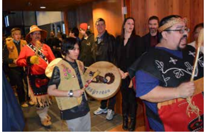
CAFN's mens drum group and Dakwakada Dancers performed.