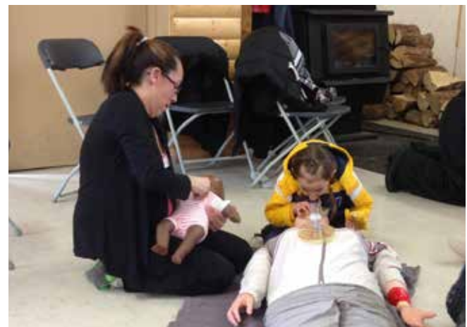
Participants of all ages learned to use the new AED at Klukshu Hall during the winter camp.