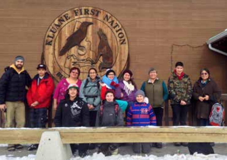
Grade 8 and 9 students from St. Elias Community School visited Burwash this winter for a Day of Learning.