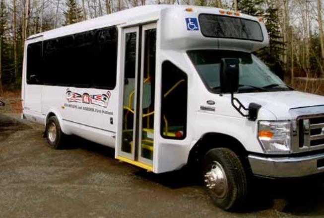
The CAFN community bus purchased in 2012 through the Gas Tax Fund and CAFN Integrated Community Sustainability Plan