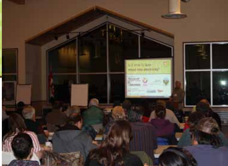
Participants at the January 23, 2013 biomass open house.

Work continues on the feasibility study funded by each of the project partners, Natural Resources Canada, Canadian Northern Economic Development Agency, and the Government of Yukon.