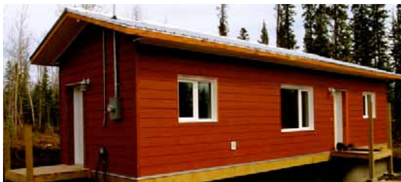
One of the CAFN Elders homes constructed in Haines Junction.