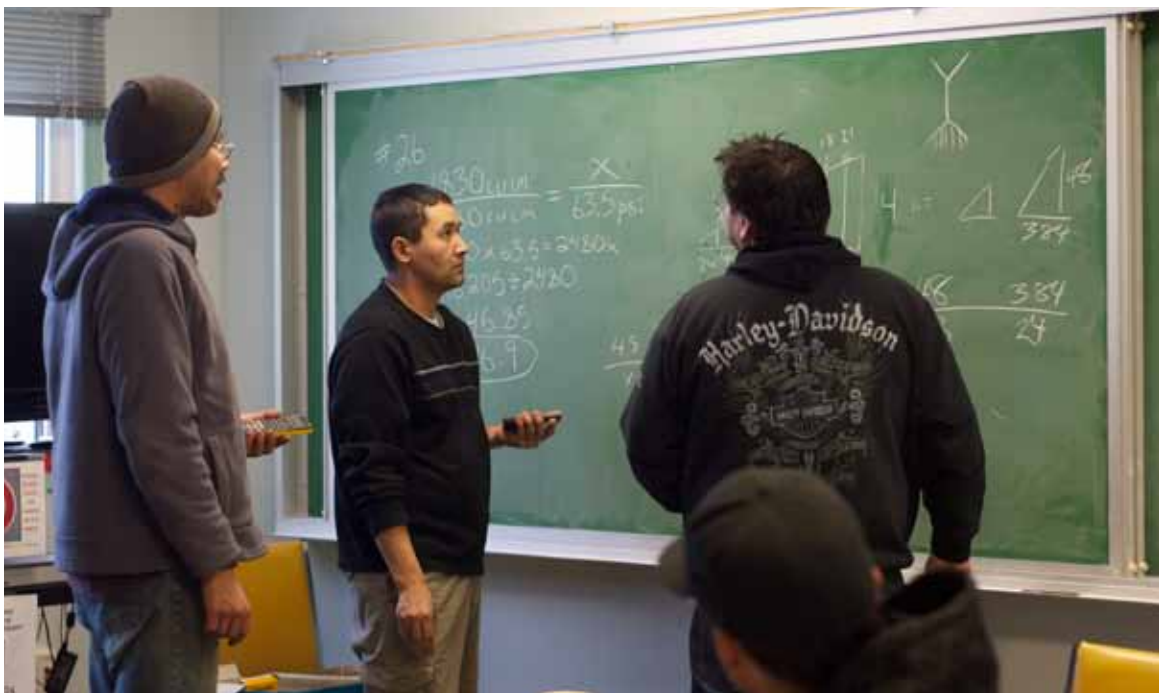
Students in the Trades Math class in Haines Junction learn how the concept of similar triangles can be used to build a 'hip' roof.

Champagne and Aishihik First Nations is holding trades training in Haines Junction and Takhini River Subdivision to increase the number of skilled tradespeople in our communities.