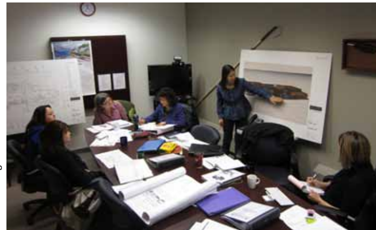
The Dä Kų Exhibit Design Advisory Committee hard at work during a meeting in spring 2011.

Many Citizens have been involved with the Parks Canada audio and visual exhibits.