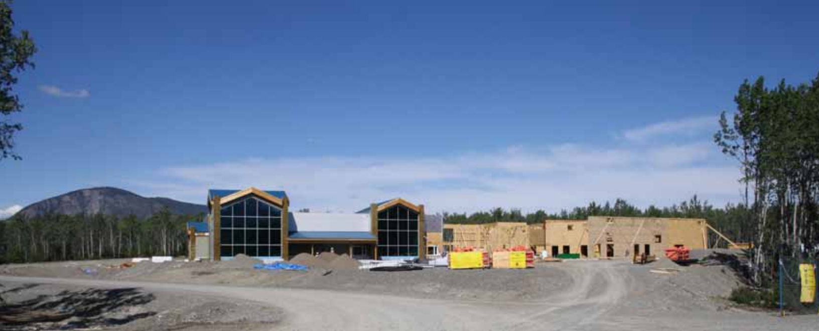
The Dä Kų Cultural Centre construction site this summer.