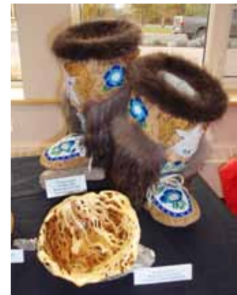
CAFN Heritage Collection