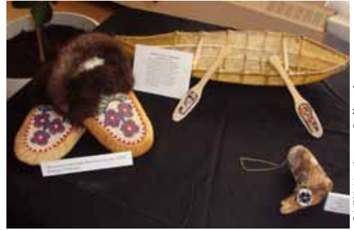
CAFN Heritage Collection

The Dä Kų Cultural Centre has dedicated space for a retail gift shop, which will be an avenue for local crafters to sell their First Nations products. A business plan is currently being developed.