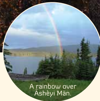
A rainbow over Ashèyi Män.