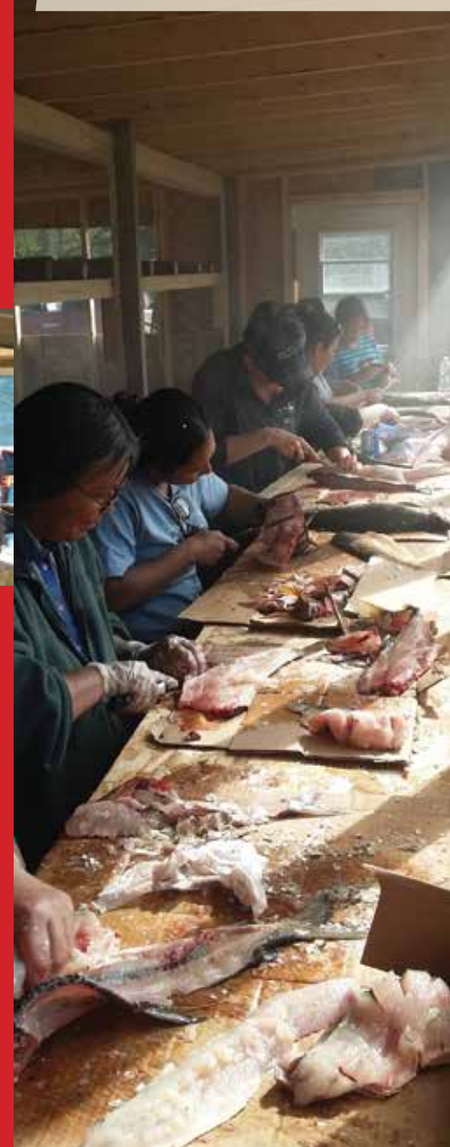
Protecting traditions: Äshèyi dän (people) preparing and drying fish in a smokehouse.